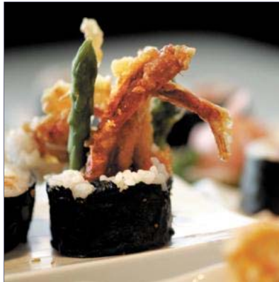
A sample of sushi and appetizers from @Bangkok.